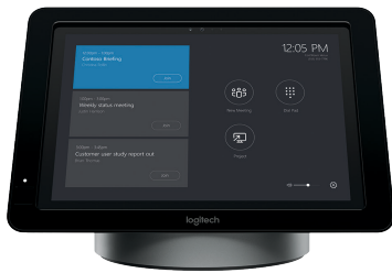
SmartDock User Interface